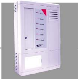
HP-1506B Power Unit