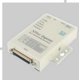
DE-211 LAN Data Converter

Complete professional feature with lower cost reader. Network configuration, upto 256 readers. 12,000 users and 14,000 transactions storage capacity available.