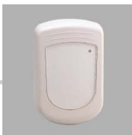
HR-310 External Card Reader