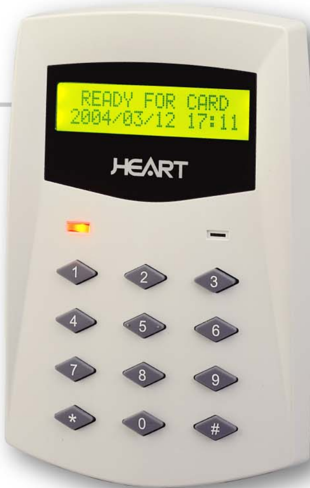
HA-5035 Access Controller